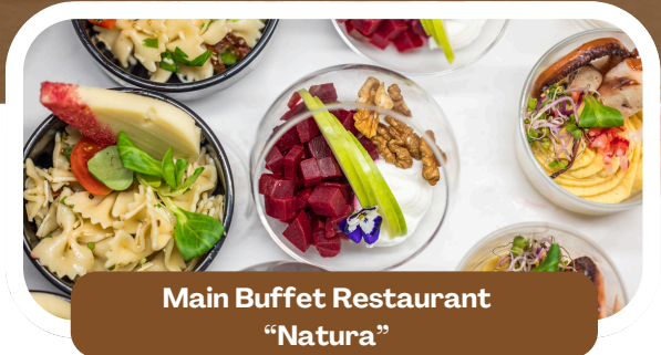
Main Buffet Restaurant "Natura"