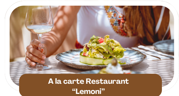
A la carte Restaurant "Lemoni"